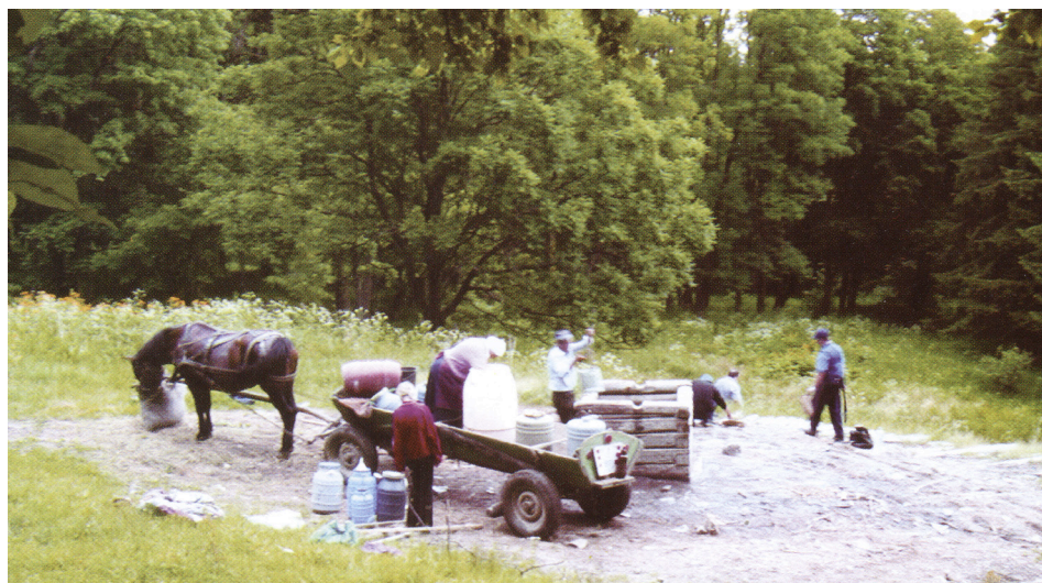
Figure 2. Brine collecting at the Solca- Slatina Mare salt spring.

The first archaeological survey in the vicinity of a salt spring was conducted in 1968. The publication and interpretation of the ceramic artefacts, on the other hand, only occurred after nearly a decade, and was carried out by a prehistoric archaeologist (Ursulescu 1977). The ceramic remains discovered in the surrounding area of this salt spring, called Slatina Mare, situated in the village of Solca (Figure 2), Suceava County, were attributed to an entire series of archaeological cultures and eras, from Starčevo-Criș, to Precucuteni, Cucuteni-phase B, the first Iron Age and the Early Modern Period. Ursulescu was the first Romanian specialist to identify in some ceramic fragments the briquetage used for the recrystallization of salt from brine. Another survey conducted in 2003 confirmed the prehistoric use of this salt spring only during the Cucuteni period (from which a large amount of briquetage were found) and the Bronze Age (Nicola et al. 2007). What seemed to be an isolated finding gave way to an entire series of salt spring for which exploitation during the archaeological time has been scientifically confirmed.