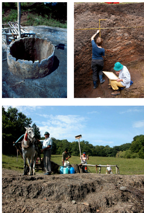
Figure 3. Poiana Slatinei–Lunca (Neamț County). Prehistoric and present exploitation of the salt spring.

At Cacica (Suceava County), despite all the changes caused by a modern salt mining exploitation that is near the salt spring, an 80-cm layer of archaeological deposits was found in the proximity of the mine, consisting in fragments of pottery (briquetage) used for boiling brine in order to produce recrystallized salt cones, and charcoal from the fires used for this purpose. The analysis of the fragments of painted pottery that were found on site showed that salt production activities were carried out here during the Cucuteni culture (Andronic 1989).