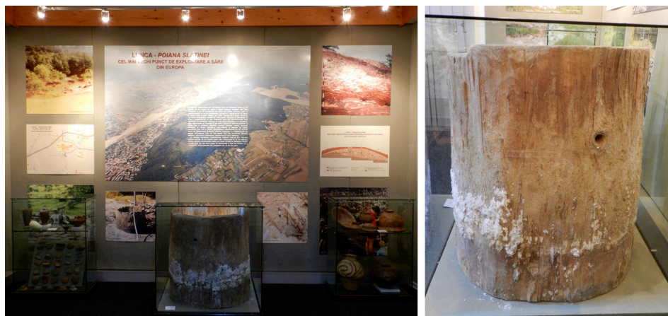
Figure 7. Display case with the buduroi from the area of Lunca–Poiana Slatinei in the permanent exhibition of the History and Ethnography Museum in T3rgu Neam7.

It is expected that museums from the neighbouring counties of Suceava and Bacau will further this initiative of emphasising the salt springs located in the respective counties that show traces of ancient exploitation. An important argument in this regard is the considerable impact that these sections have had on visitors. We are, of course, referring to visitors from Romania, but especially to foreign ones, which seem to appreciate to a higher degree the significance of these archaeological facts, which are little known abroad.