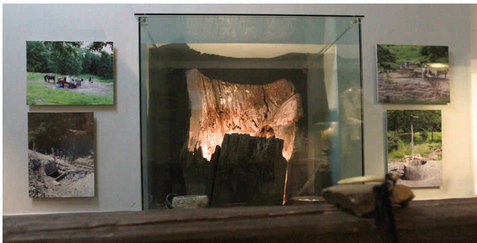
Figure 6. Display case with the buduroi from Țolici–Hălăbutoaia in the permanent exhibition of the Piatra Neamț County Museum.

In general, the same exhibition principles were followed as in the similar section in the Piatra Neamț Museum. In this case too, it should be mentioned that the exhibition does not display the original buduroi from Poiana Slatinei, where the exploitation of the salt spring by the rural communities continues to this day. The buduroi displayed in the permanent exhibition at the Târgu Neamț Museum came from Oglinzi-Slătior, a less important salt spring from the area.