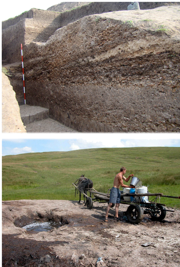
Figure 4. Hălăbutoaia–Țolici (Neamț County). Prehistoric and present exploitation of the salt spring.

What differentiates Romanian salt springs from those found in more famous areas of Europe (especially France and Germany) is the continuity of exploitation and use of natural brine even in present times (Alexianu et al. 1992; 2007) (Figure 5). This unique opportunity in Europe was capitalised by the two already-mentioned ethnoarchaeological research projects financed by the Romanian Government. The research conducted in the framework of these two projects followed two main directions: the identification of the salt springs and salt mountains/cliffs and the adjacent archaeological vestiges, and the ethnological investigations through spatial analysis. As we did not commence with preconceived ideas, realities on the field forced us to address quite diverse topics (the only ones mentioned here being the ones related strictly to the salt springs).