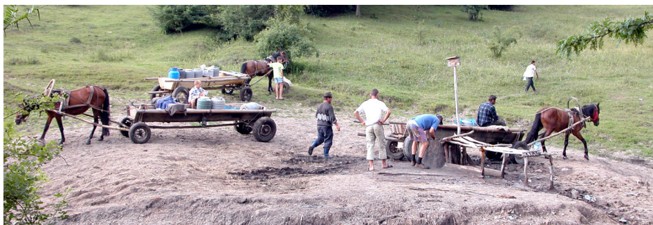
Figure 5. Present-day exploitation at Lunca-Poiana Slatinei.

Thus, much needed attention was given to abandoned salt springs. We defined a typology of salt-spring catchment systems, we performed a classification of settlements that use salt springs, we analysed the means of transport of natural brine, we identified the spatial-temporal strategies for producing recrystallized salt (Rmn. huscă ), and studied the transmission of knowledge from one generation to another. In terms of current use of natural brine from salt springs we studied human nutrition, food conservation, animal nutrition, traditional human salt therapy, craft uses, hunting and salt spring related hunting, the symbolic use of salt, exchange, sale, gift, etc. (Alexianu, Weller and Brigand, 2007).